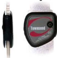
Patented ultra-low profile TM5 Townsend Motion Hinges

TM5 and TM5+ hinges available in aircraft aluminum, titanium or stainless steel.